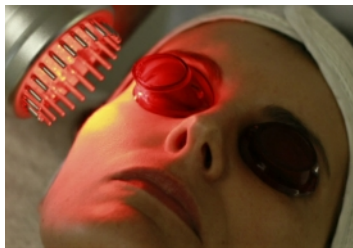
LED light Therapy